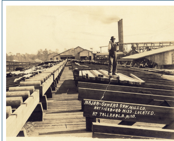
TALLAHALA SAW MILL, CIRCA 1928 FROM THE MAJOR-SOWERS SAW MILL PHOTOGRAPHS COLLECTION PHOTOGRAPH OF A SAW MILL WORKER STANDING ON A STACK OF TIMBER AT MAJOR-SOWERS COMPANY, TALLAHALA SITE