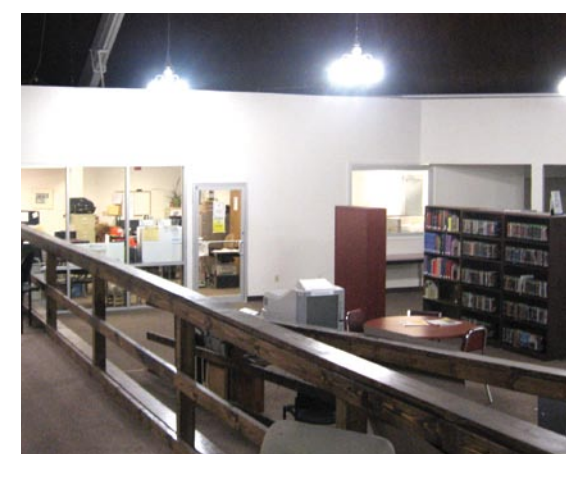
Gulf Coast Student Service Center

The Southern Miss Gulf Park Learning Commons will provide workstations for both individuals and groups. It will also support access to and the creation of information through a variety of resources including a hightech presentation room, a computer lab, laptop loans, a proctoring classroom, a writing and speaking center, and a coffee café!